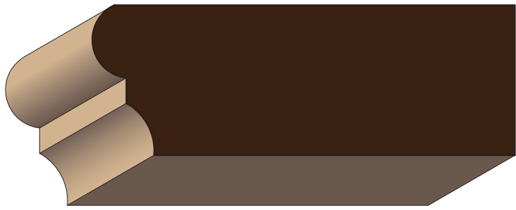
STO 647 1\frac{1}{8} x 3\frac{1}{8}