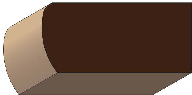
STO 68 1\frac{3}{16} x 2\frac{1}{2}