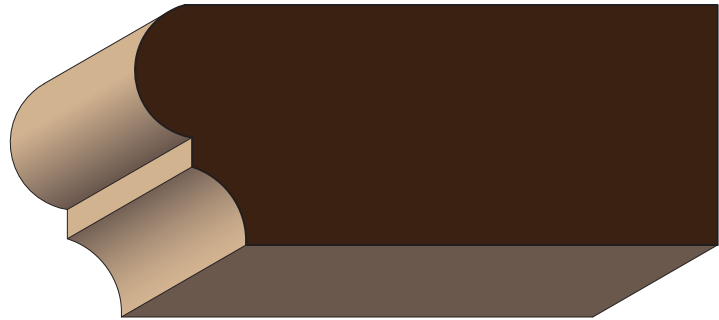
STO 643 1\frac{1}{4} x 3